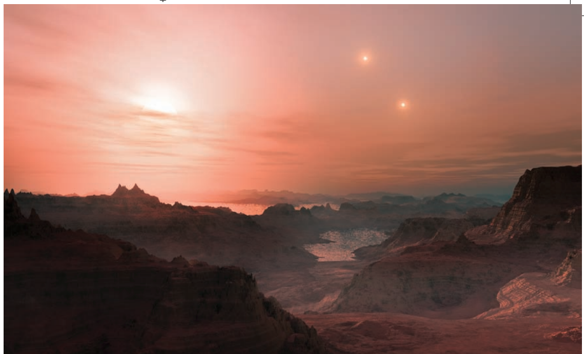
▲ Sunset on a super-earth orbiting a red dwarf in a triple star system. Are those alien mountains formed by plate tectonics or some other means?

While the Plate Tectonic Wars have been useful for exploring models, they haven't answered the question of whether plate tectonics are actually necessary for life. During the Q&A after Foley's lecture, David Grinspoon asked pointedly: do our arguments about plate tectonics betray a failure of imagination about what life needs? Perhaps, he suggested, aliens living happily on stagnant-lid planets would think that Earth is too scary and unstable for complex life, with its constant volcanoes, earthquakes and tsunamis. In an interview afterward Grinspoon said, "I could do a thought experiment of intelligent species who evolved on some other planet and developed science saying, 'Well, there's no way you could have life on one of these planets with plate tectonics, because that's just so unstable, that's crazy!' The crust is moving around and the climate oscillates and it's really fickle and unstable and unsuitable for life. I think that we're used to Earth and its kind of activity and, therefore, we assume that a planet's life has to be like this. But I'm not sure we know enough to say that's true."