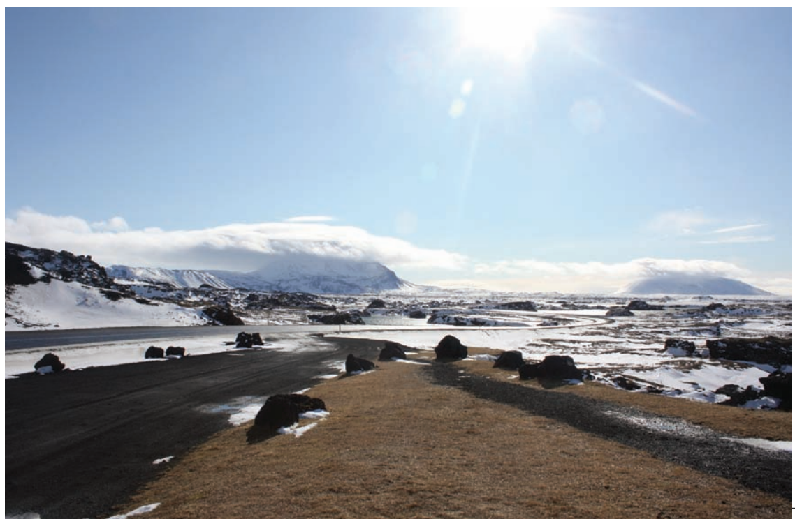
▼ The legacy of plate tectonics on Earth. This image is of a region in north-east Iceland, where the Mid-Atlantic Ridge cuts through. The tabletop mountains are formed by volcanic activity. Could such landscapes exist on super-earths?

Michael Chorost is a science writer based in Washington DC and author of two books, including World Wide Mind . Visit his website at www.michaelchorost.com .